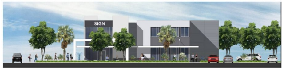
PROPOSED WEST ELEVATION OPTION 1 SCALE: 1/16"