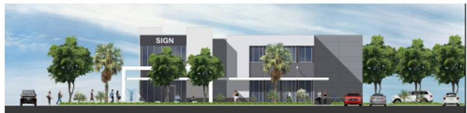
PROPOSED WEST ELEVATION OPTION 1