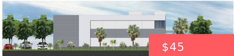
PROPOSED EAST ELEVATION OPTION 1