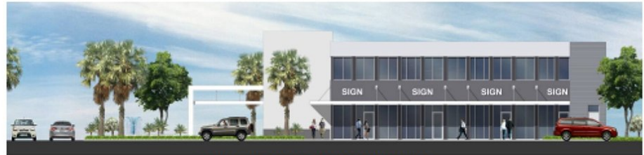
PROPOSED SOUTH ELEVATION OPTION 1