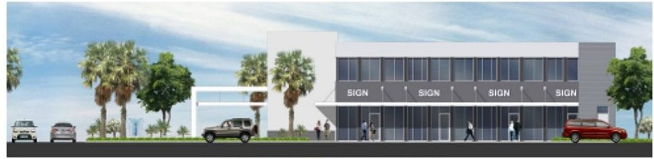
PROPOSED SOUTH ELEVATION OPTION 1 SCALE: 1/16"